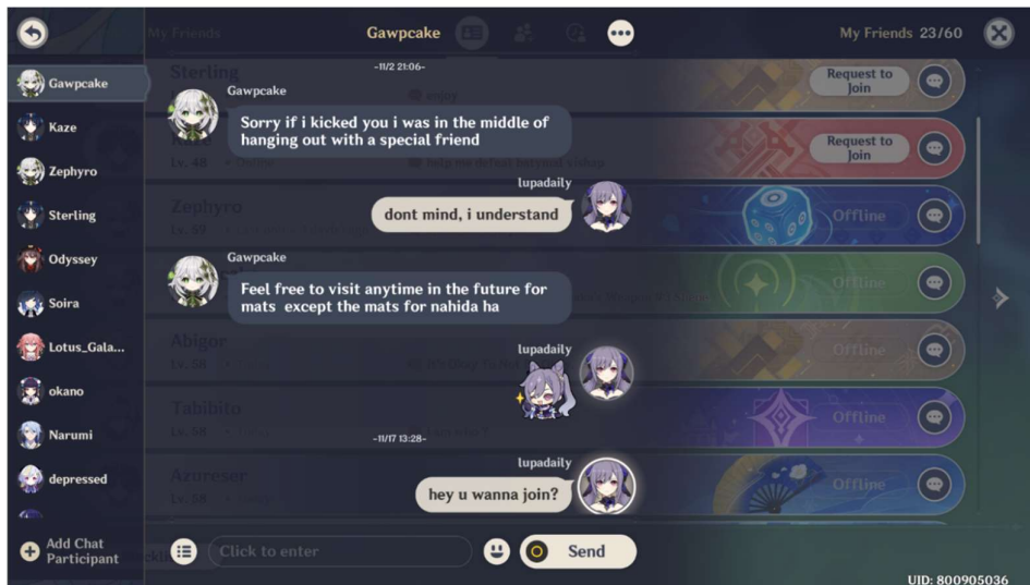
Figure 1 Screenshot of In-game Chat