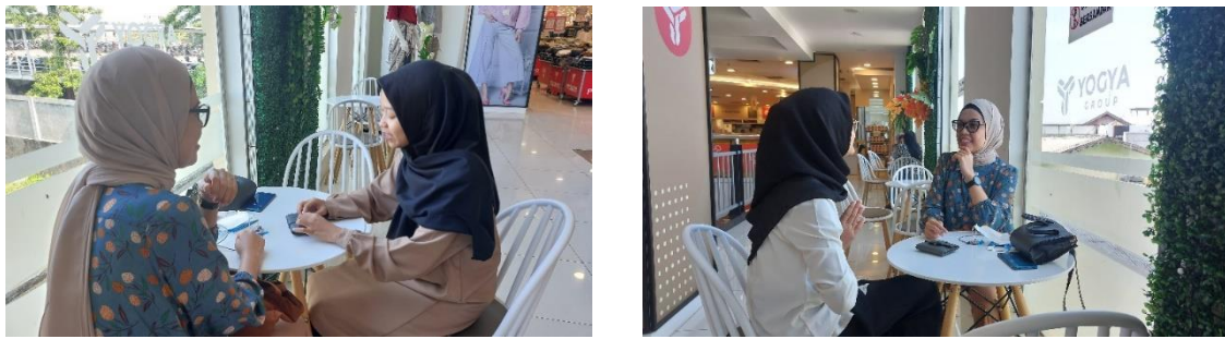
Figure 2. Interview Documentation

Based on this data, the interviewee experienced aphasia (aphasia) as a result of an accident, so it was difficult to pronounce the letter r , repeated to pronounce the actual word, had difficulty pronouncing words clearly, and spoke quickly so that the words spoken were not clear and meaningful. Therefore, it can be concluded that the resource person suffers from Broca's aphasia.