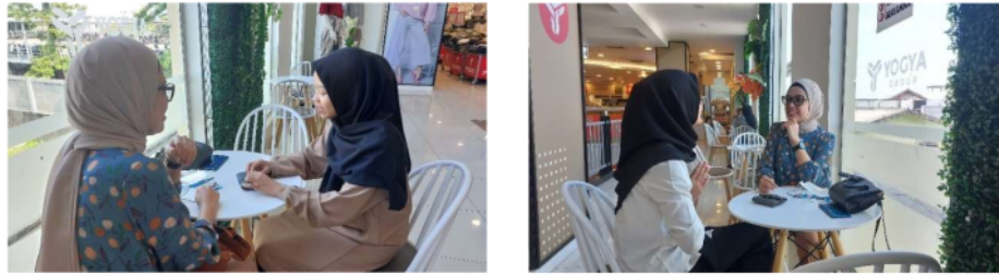
Figure 2. Interview Documentation

Based on this data, the interviewee experienced aphasia (aphasia) as a result of an accident, so it was difficult to pronounce the letter r , repeated to pronounce the actual word, had difficulty pronouncing words clearly, and spoke quickly so that the words spoken were not clear and meaningful. Therefore, it can be concluded that the resource person suffers from Broca's aphasia.